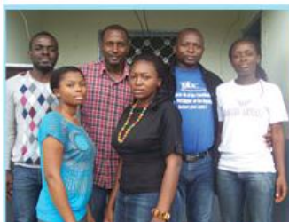
The PHESA staff with members of the MDDT Team

As regards the livelihood of students in general, an intense examination of the university community of Buea in the South West Region of Cameroon paints a gruesome picture of what might obtain in most communities surrounding higher institutions in Cameroon. One will be surprised to know that some students are sent off to school at the beginning of an