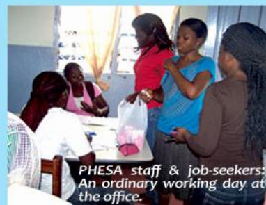
PHESA staff & job-seekers: An ordinary working day at the office.