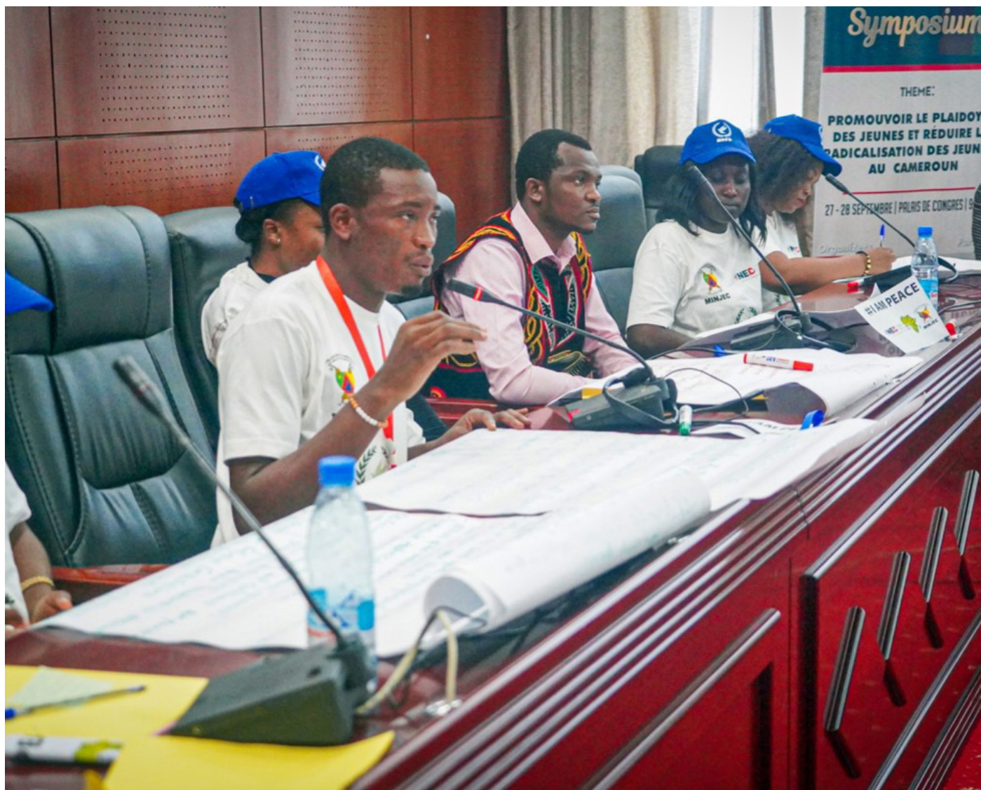
SYMPOSIUM PANEL DISCUSSIONS