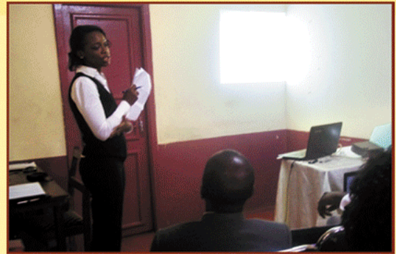
Above: “The role of human resource management in organizations”

For more information on these training workshops you may log on to our website and visit the appendix section of presentations ( www.mddtcameroon.org ).