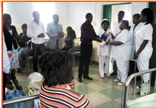
MDDT offering medication and gifts to patients and staff of the paediatric ward of the Regional Hospital Buea, S.W.R. Cameroon in commemoration of the World Human Rights Day.

http://www.un.org/en/events/humanrightsdays/