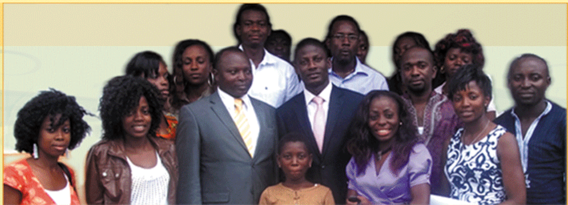
Below: MDDT members and participants pose for a group picture at the end of the seminar and workshop.