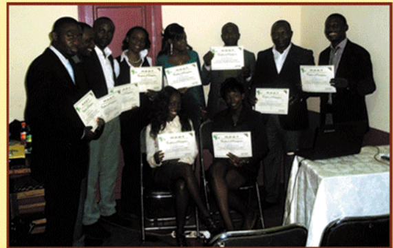
Right: Certificates were awarded to all seminar participants.