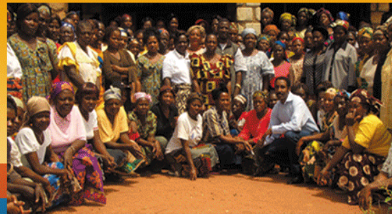
Legalization and restructuring of rural groups to foster economic development in Ngoketunjia Division, N.W.R.

Economic Empowerment: For the past eleven years, the Movement has carried out a number of community services in the North West Region of Cameroon especially among the women folk and vulnerable children. MDDT provided the women of Donga and Mantung Divisions with farm inputs like improved seeds such as corn and beans, fertilizers, pesticides and in some situations, farm tools like hoes, cutlasses, spades and wheelbarrows. The movement also initiated the women of Bafut in particular, into farming ginger on a large scale. Right now the Bafut women in the Northwest Region are the highest producers and suppliers of ginger in our local markets. MDDT intends to solicit small ginger industries to make use of the large production of ginger in the area.