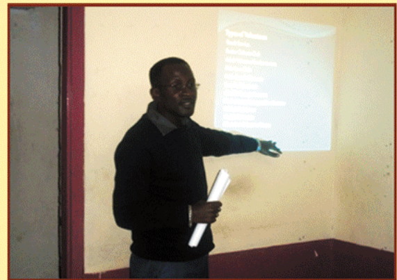
Below: Talking on “Volunteerism and community service”