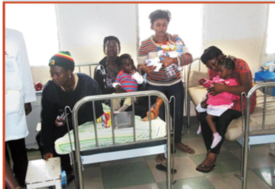
Mothers and children of the Paediatric Ward expressing their appreciation after receiving medication and gifts from the MDDT Delegation